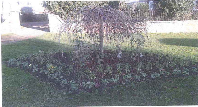
The diamond bed at the western end of North Lane: the proposed site of the memorial